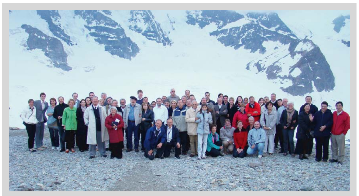
Figure 1: Participants of the gala dinner at Diavolezza (2970 m above sea level).

The topics of the 12 symposia were: “Interactions of blood cells with surfaces” (Chairmen: Jung, Franke), “Exercise and Hemorheology” (Connes, Brun), “Red blood cell adhesion in human pathology” (Wautier, Nash), “Comparative evaluation of instruments for measuring red blood cell aggregation and deformability” (Meiselman, Baskurt; a joint effort of several members of the International Society for Clinical Hemorheology testing simultaneously different instruments), “Interrelationship between endothelial wall and blood under normal and pathological conditions” (Caimi, Colantuoni; Italian Society of Clinical Hemorheology and Microcirculation), “Ultrasound on the way to microcirculation” (Jung, Clevvert; German Society of Clinical Microcirculation and Hemorheology), “Methodology – new developments in Hemorheology” (Hardeman, Shin), “Red cell aggregation, Hemorheology and cerebral circulation” (Antonova, Baskurt; Bulgarian